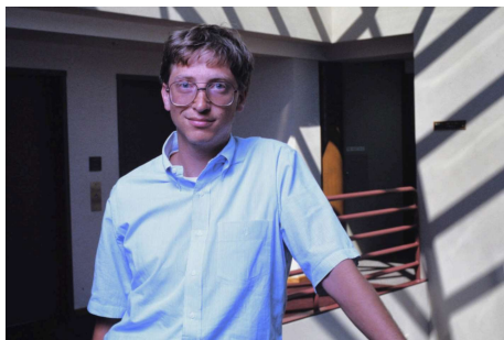
A very young Bill Gates.