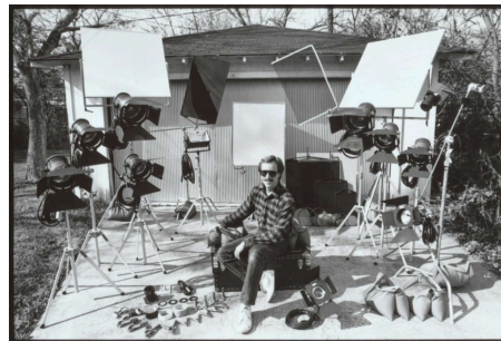
Circa 1983 first bank loan for equipment.