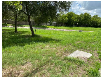
Area around the drainage ditch